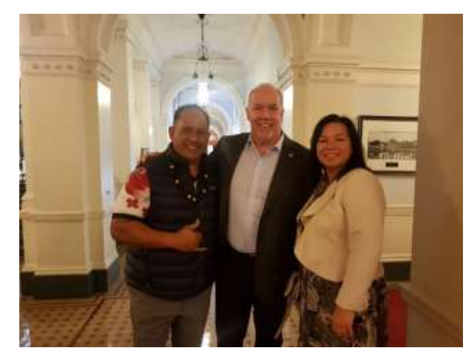
Figure 2 - Mua, Premier Horgan & April mark Multi-cultural week in BC

As we plan for beyond 45, we are embarking on a voyage of re-connection to South Pacific peoples, partners, places and initiatives that have resulted in