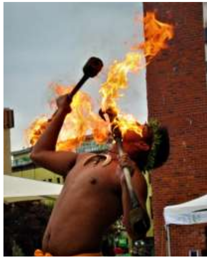
Pacific Indigenous arts and cultures through music, dance, film, digital art and community discourse. The solidarity building program included special guests and participants from Samoa, Hawai'i, and Australia. All were respectfully received and welcomed by members of the Songhees and Esquimalt Nations. In the course of the program approximately 1500 people participated directly within the rich program offerings.

One Wave Gathering is held with permission and engagement of Songhees & Esquimalt Nations on the traditional territory of the Lekwungen speaking peoples. The 11th One Wave Gathering spanned two weeks and was held in three venues, providing a host of free public programming that celebrated