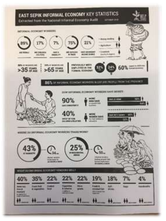
Figure 5 - Sample Baseline Survey Infographic

Now entering year three, Vendors Collective Voices is making vendors aware of the PNG Constitution, the Informal Economy (IE) Act, and PNG's commitments to global human rights and gender equality norms and standards and sustainable and inclusive development. It is about engaging vendors in participatory research to become more aware of the injustice of their 'working conditions' and the current governance of markets and street trade. The project aims to strengthen women vendors' organisation, leadership, confidence and capacity to advocate for change and shape informal economy development as it was envisaged in the constitution and in the new IE law. On the supply side, the project will also contribute to the gender and rights awareness and sensitization of local government leaders and administrators, so that constructive engagement of vendors with local government is possible and effective.